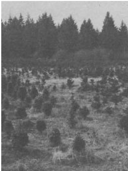
Figure 2. —Openings and stunted trees in this noble fir Christmas tree plantation are caused by pocket gophers.