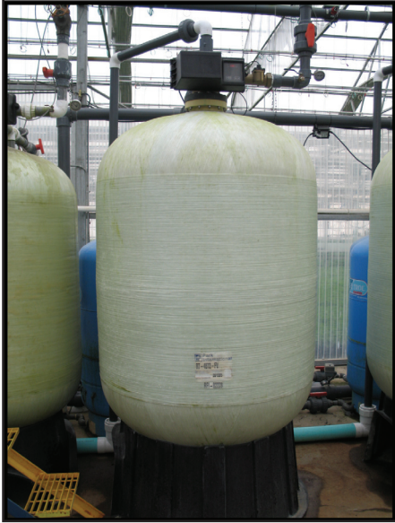
Figure 1. This reverse osmosis system was installed at a young plant production greenhouse to remove pathogens from water used to irrigate young plants.

Removal of biological organisms may be important if you are recycling irrigation water for propagation and are concerned about the presence of plant pathogens or if you have problems of iron-fixing bacteria in your water. There are several options for sterilizing water to remove living sources of contamination. Reverse osmosis systems are costly, but effective, systems for removing unwanted contaminants. Water is forced through semi-permeable membranes in a reverse osmosis system (Fig. 1).