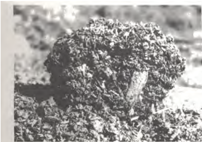
Figure 1. Sawdust "clods" slowly break down into humus.

Tilth is improved by green manuring, especially in finer-textured soil. This occurs by the interaction of factors associated with improved aggregation of the fine clay particles and in a lower bulk density (Allison 1973). Sandy soil is benefited by green manuring through increased moisture-holding capacity and increased availability of nutrients. One of the chief benefits to sandy soil is an increase in cation exchange capacity. All these benefits are realized soon