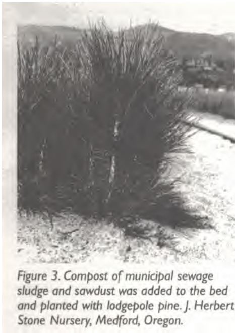
Figure 3. Compost of municipal sewage sludge and sawdust was added to the bed and planted with lodgepole pine. J. Herbert Stone Nursery, Medford, Oregon.

aggregate stability and cation exchange capacity, and it may increase availability of various nutrients as the organic material decomposes (van den Driessche 1969).