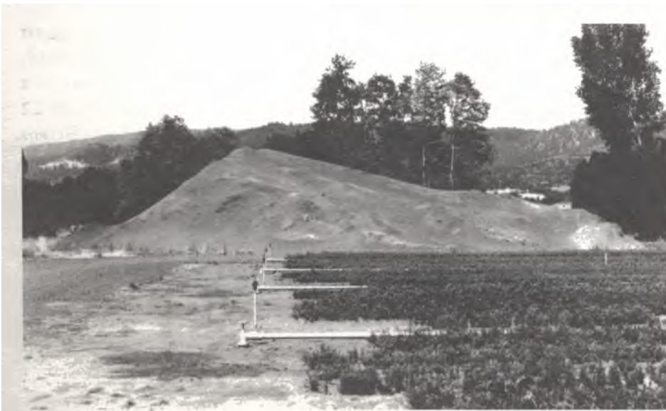
Figure 4. Sawdust piles can become sour if left in moist and anaerobic condition.

(1957) should be sufficient. They suggest adding 5-10 pounds of nitrogen per ton of sawdust during the first year followed by half that amount the second and third years. This rate is sufficient for most sawdusts except alder. Alder sawdust is more readily decomposed than other (Table 10) and therefore requires a higher ini-