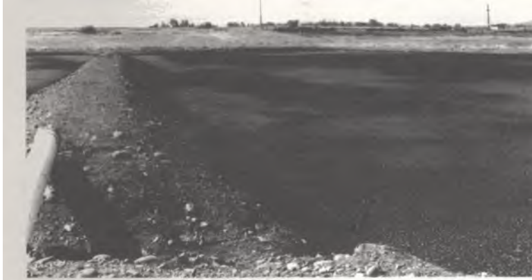
Figure 6. Sludge in drying beds following digestion. Vernon Thorpe Water Quality Control Plant, City of Medford.