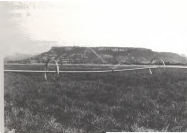
Figure 7. Effluent irrigation of fescue, orchard grass, and New Zealand clover. Vernon Thorpe Water Quality Control Plant, City of Medford.

3 Methylene-Blue-Active Substance. A method of determining the quantity of detergent in effluent.