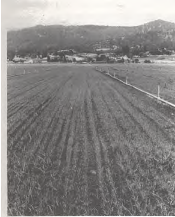
Figure 5. Sawdust watered just before planting the cover crop. J. Herbert Stone Nursery, Medford, Oregon.

As an Incorporated Amendment. Disking is preferred over plowing to incorporate wood products. Amounts of sawdust, bark, or wood chips to incorporate may vary according to desired organic level. Application rates range from 10-100 tons per acre. Optimal time to incorporate is before the cover crop is planted rather than before seedlings are planted (Figure 5).