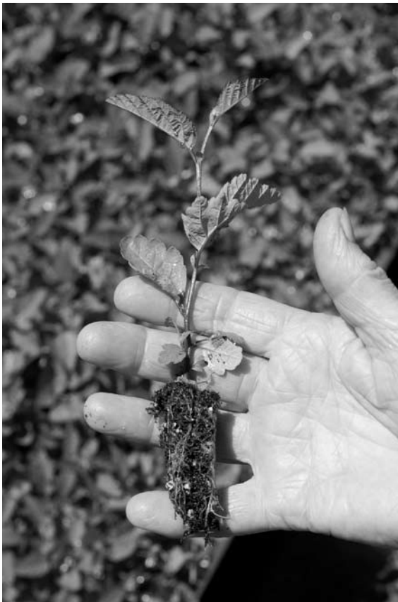
Figure 5 —Native plants are being sown in miniplugs because it is easier to manage uneven germination rates.

containers. In some of the very first trials with miniplugs in Ontario, they were able to reduce the seed-to-seedling ratio from 12:1 to 3:1 (Klapprat 1988). Increased seed use efficiency is even more important with genetically-improved forest tree seeds, or with native plants where seeds are scarce or have irregular germination due to complicated dormancy requirements (fig. 5).