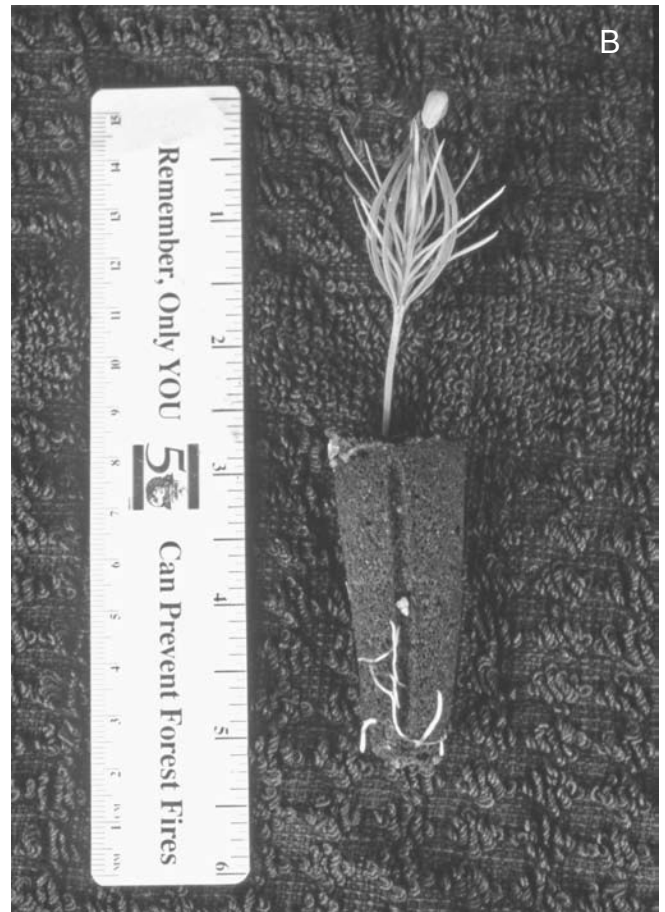
Figure 1 —Most miniplugs used in forest and conservation nurseries feature stabilized media that hold the root plug together and allow earlier transplanting: (A) Jiffy-7® Forestry Pellet, (B) Q plug®.

2. Chemically Stabilized Plugs. This newer system uses chemical binders to hold the growing media together (fig. 1B). All of the chemical binders are trade secrets, but examples include Q plugs®, Excel® plugs, Preforma® plugs, and HortiPlugs® (table 1).