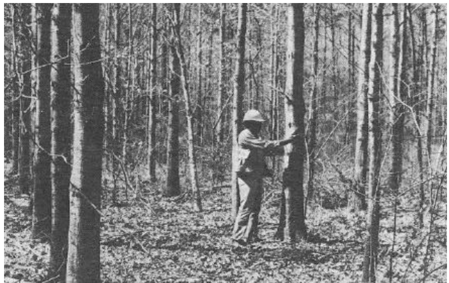
Figure 1. —Twenty-year-old Shumard oak planted on an eroded ridgetop site.

Survival was recorded and height measured annually for 5 years. At 20 years in the field, diameter and height were measured and survival recorded (fig. 1). Data were evaluated by a least-squares analysis