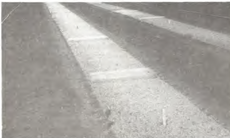
Figure 2—Wire bird exclusion cages were randomly located in each plot.

adverse effects of Mesurool at concentrations up to 4 percent active ingredient (fig. 3). Neither the germination rate nor the seedling emergence index differed significantly from the control at the 0.05 probability level. Considering that the label's application rate is between 0.5 and 1.0 percent active ingredient per 100 pounds of seed, the potential for phototoxicity appears to be slight.