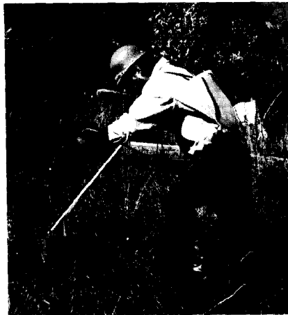
Figure 1 —Worker applying herbicide with the modified Spotgun around a tree protected with an improvised shield.

solid stream. It applies a metered amount of liquid with each pull of the trigger and refills the metered chamber (fig. 2) from a small backpack reservoir (figs. 1 and 3).