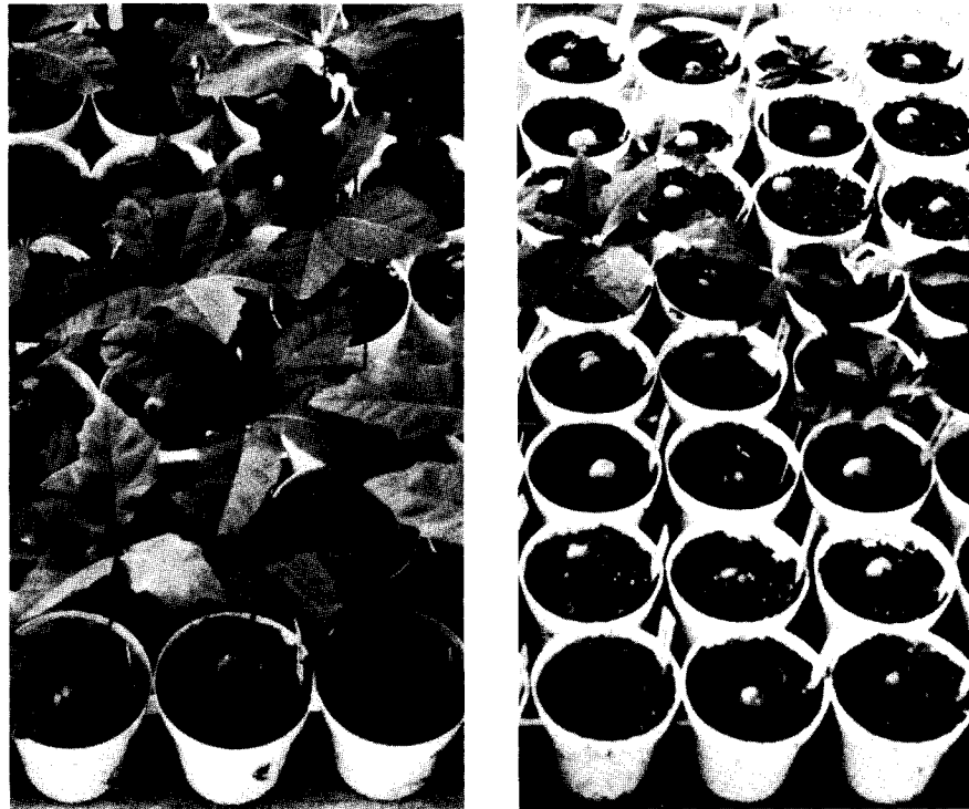
Figure 2 —Medium-incorporated inoculation method. Controls at left and damped-off inoculated at right.

Cylindrocladium crotalariae was reisolated from 43 percent of all symptomatic seedlings in the inoculation trials, but a higher percentage of the successful isolations were obtained from the root dip method than from the medium incorporation method (57 and 33 percent, respectively). Only saprophytic fungi were associated with the ungerminated control.