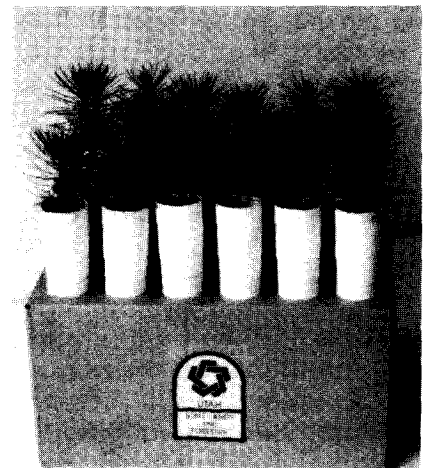
Figure 1A —An empty tote-rack. B —A tote-rack holding pine seedlings in the Super Cells.

not planted immediately. There are hand holds cut in the sides of the tote-racks.