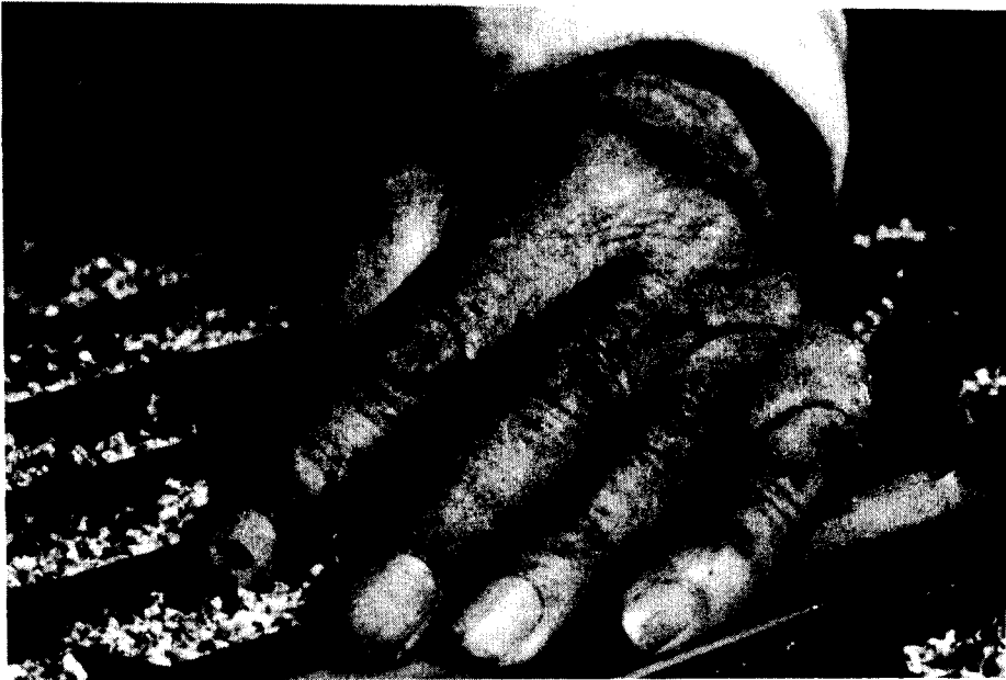
Figure 5 — Emerging seedling in late April.