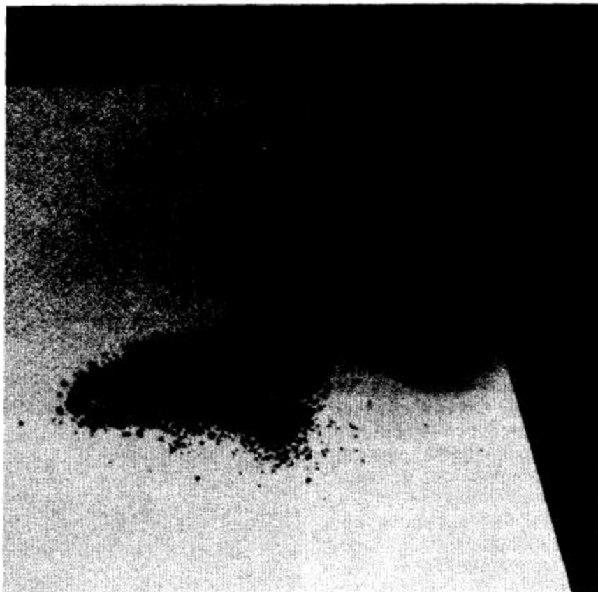
Figure 1 —The small Eucalyptus umigera seed mixed with the trash of the seed capsule.

Another problem involves the need for moist stratification of some seeds, not only for some species but also for some provenances of a single species. Doran and