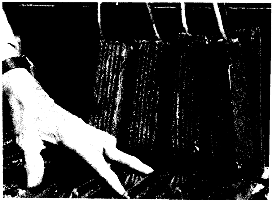
Figure 6 — Opened-up book of Tinus container showing rooting ball of 1-year-old seedlings.