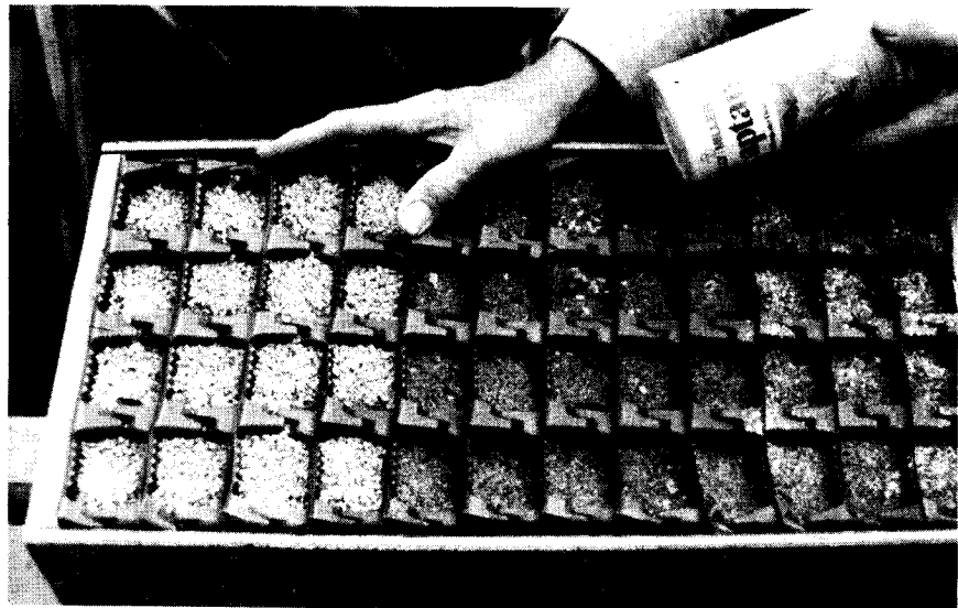
Figure 3 —Dusting seed with 5 percent captan prior to covering with potting mix and "chicken grit." Containers on the left show the "chicken grit"—No. 2 quartz rock—used to protect the seed.