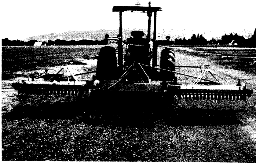
Figure 1 —The trip bedformer. Note protruding rods from bedformers that mark the beds.

At the J. Herbert Stone Nursery, sowing is accomplished with two seed drills operating simultaneously. This requires a good deal of coordination between the tractor operators preparing the seedbeds and the two seed-drill operators.