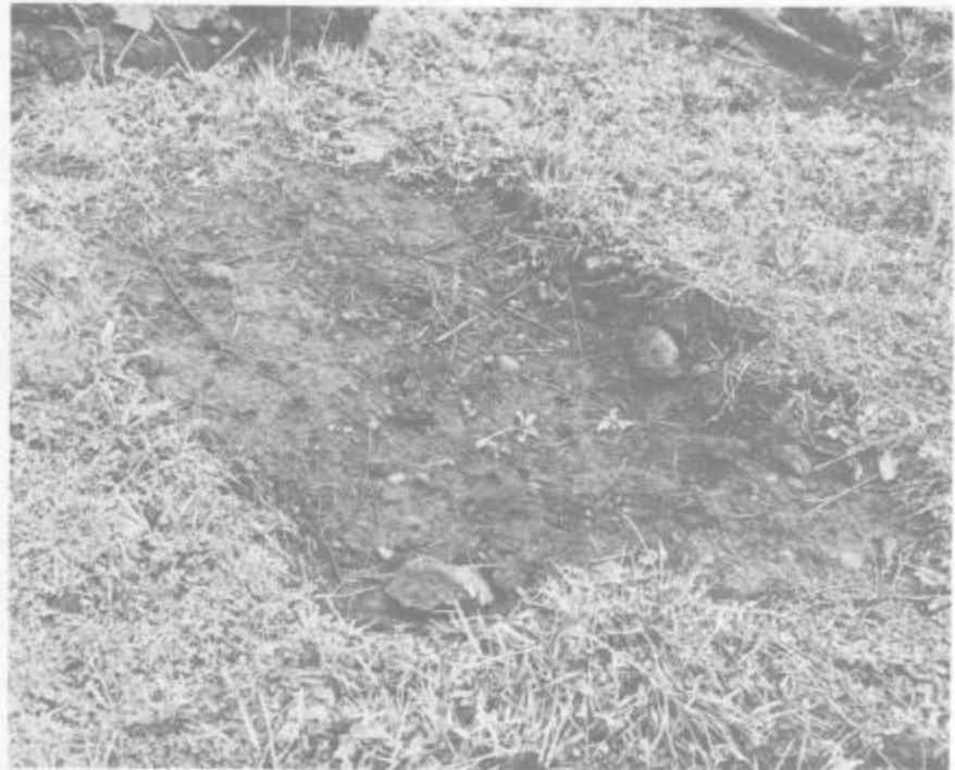
Figure 3—Typical spot prepared by crawler-tractor-mounted scalper, measuring 3 feet by 3 feet.

For further information on these implements, write or call the Missoula Equipment Development Center, Building 1, Fort Missoula, Missoula, MT 59801; (406) 329-3958 or FTS 585-3958.