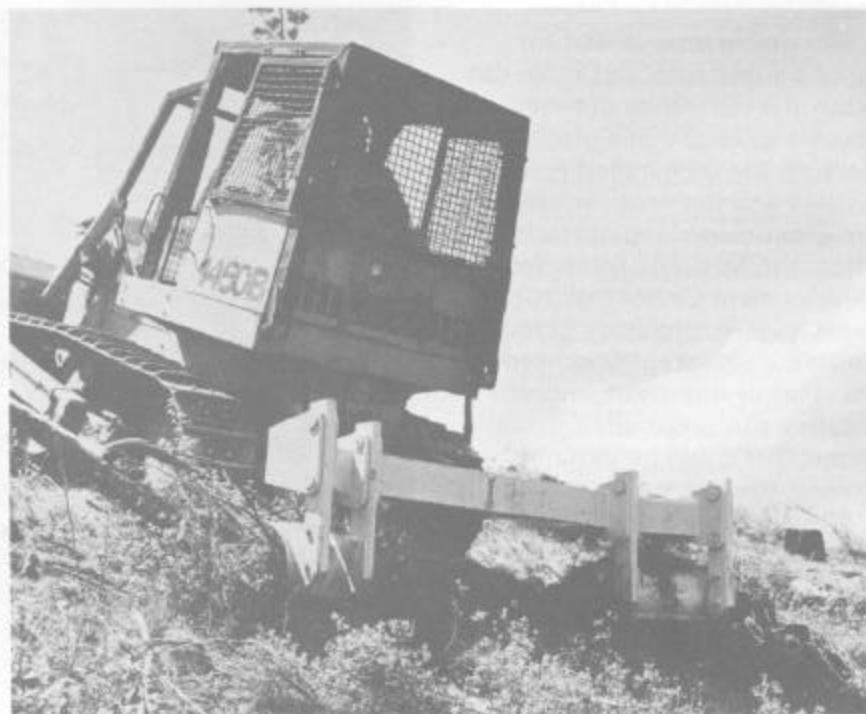
Figure 2—Rocky Mountain Scalper.