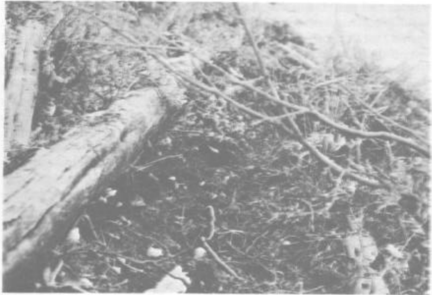
Figure 3—Typical spot dug out by cable scarifier.

Our scarifying implement did not work well in the area. Even five of six passes were not enough to create adequate planting spots. The brush proved too thick and limber. The implement simply skidded over much of the