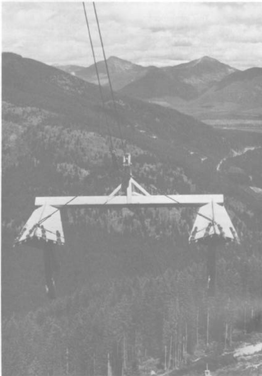
Figure 1—Scarifier implement rides skyline cable downslope to begin digging planting spots.

In the meantime, mechanical methods can offer some of the best site preparation alternatives.