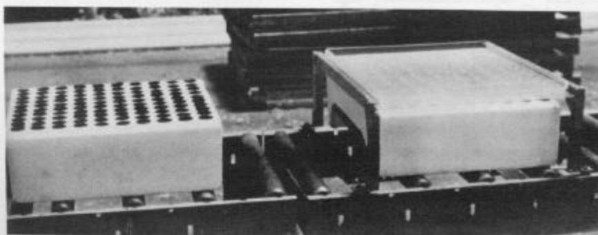
Figure 4—Manual seeder for sowing pelletized eucalyptus seed into containers.

seeder consists of a frame that holds 3 Plexiglas® plates above the containers. The top plate is about \frac{1}{2} inch thick, the middle plate is about the same thickness as the diameter of the pelletized seed, and the bottom plate is about \frac{1}{4} inch thick. The top and bottom plates are held in a fixed position so that their holes do not line up; the middle plate slides between them. The plates have holes in them that are in the same arrangement as the containers to be sown. The holes in the top and bottom plates are about 2.5 times the diameter of the pelletized seeds, while the holes in the middle plate are just slightly larger than the pelletized seeds. The holes in the top plate are countersunk to concentrate the seeds around the holes. The top edges of the holes in the middle plate are beveled to reduce the chance of damaging the seed as the plate is moved back and forth.