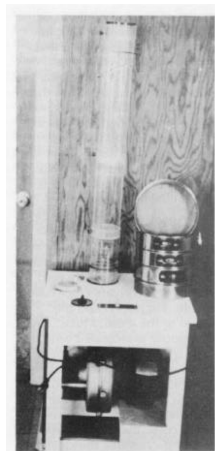
Figure 1—Sieves (right) and blower-cleaner (left) used to clean eucalyptus seeds.

Although eucalyptus seed and chaff are similar in size and weight, enough differences exist to allow a large percentage of the chaff to be removed with sieves and seed blowers (fig. 1). We recommend using U.S.