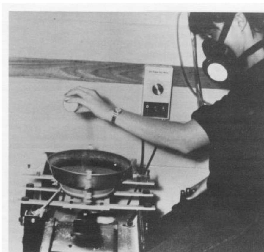
Figure 3—Eucalyptus seed being pelletized in a reciprocating-rotating pan.