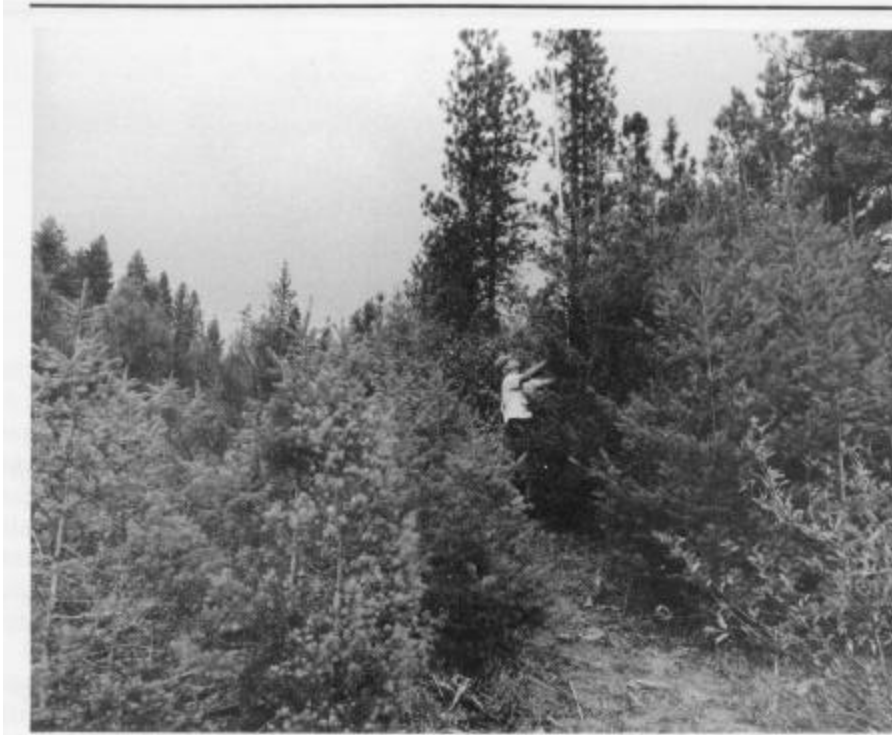
Figure 3 —Comparison of fall- and spring-lifted seedling plots after 13 years. The Douglas-fir trees on the right side of the photo were lifted in the fall. Those on the left were lifted in the spring. Both plots shown were crated seedlings stored at 33 °F.