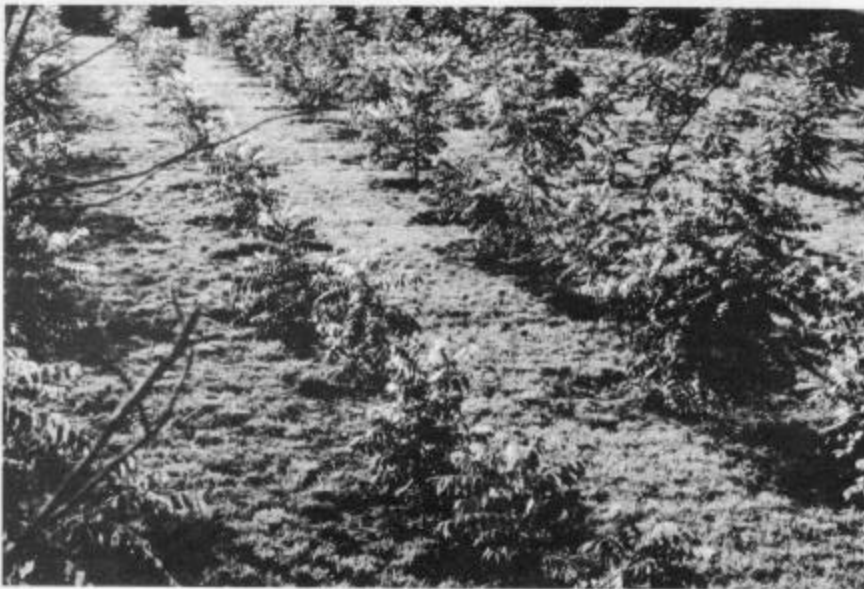
Figure 2 —Growth differences can be clearly seen between the genetically improved stock and nursery-run seedlings. The shorter trees in the center row are nursery-run stock. Trees are 2½ years old at the time of the photograph.

One of the major attributes of the Purdue #1 grafted stock has been terminal dominance, leading to excellent stem form (1). Beineke obtained a 61% improvement in stem form for grafts versus nursery stock in Indiana. However, his data and those reported in this paper cannot be compared, due to the different methods used to evaluate stem form in the two studies. Beineke used a 5-point subjective rating system that evaluated the entire stem, whereas in this study only the number of terminal shoots were reported.