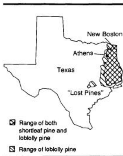
Figure 1—Location of study sites in relation to natural ranges of loblolly and shortleaf pines.

Experimental design. On each site, three complete replications were established. Each replication consisted of 12 numerically square plots, each containing all combinations of the four preplanting treatments and three genetic sources. Individual plots consisted of 49 trees from one combination of treatment and genetic source. Combinations were randomly assigned to plots within replications. Seedlings were planted on a 1.8 by 3.0 m spacing, with at least two border rows planted around each replication.