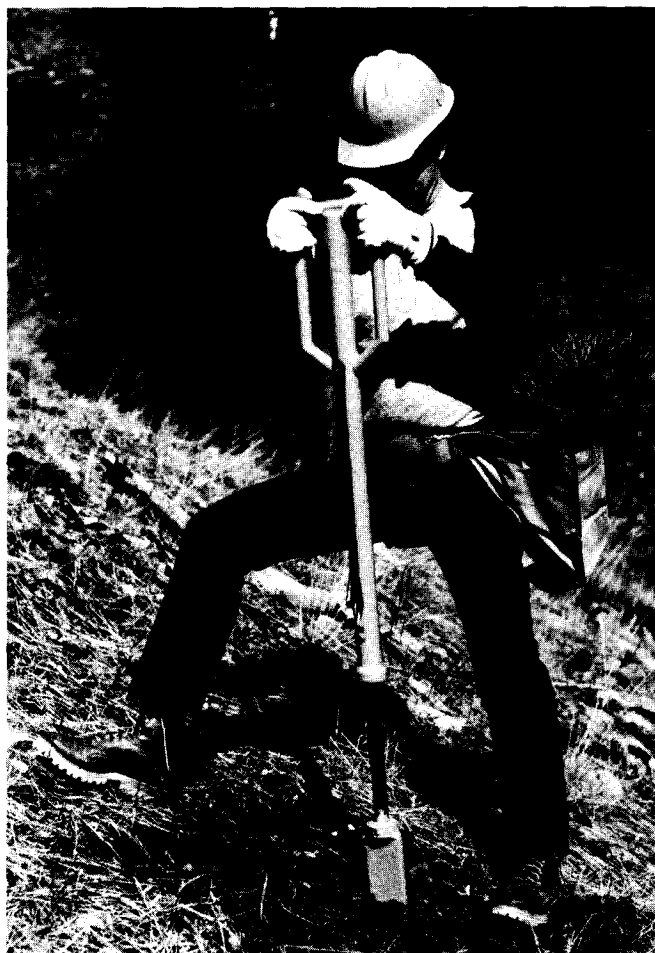
Figure 2 —Hammer-action hand planter with a double-D handle.