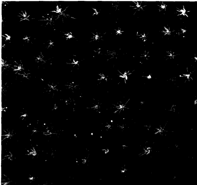
Figure 3 —Nearly perfect cavity-stocking of black spruce using the Techniculture container system.

In summary, priming black spruce seeds in water rather than not priming them or priming them in osmotic solutions appears to have merit for single seed sowing into containers. It may shorten production time by about a week, thus lowering greenhouse heating costs. However, this treatment alone cannot increase absolute container stocking. Further efforts are in progress to integrate the priming treatment with flotation-based removal of nonviable seed (Bergsten 1987). By far the greatest economic gains in terms of single-seed sowing systems will be made by using seeds as close to 100% germination rate and cavity stocking rate as possible (figure 3).