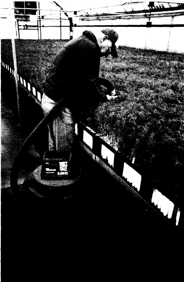
Figure 1—Worker vacuuming away dead larch needles.