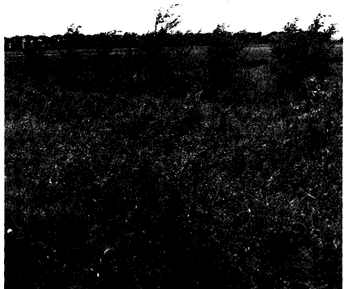
Figure 1—Outplanted hackberry seedlings.

Hackberry seed was collected from native trees on 219 sites from across its natural range (figure 2) in the Great Plains during 1982 to 1988. These collections included samples from 57 seed zones throughout the Great Plains portion of hackberry's range. The seed zones were originally defined by