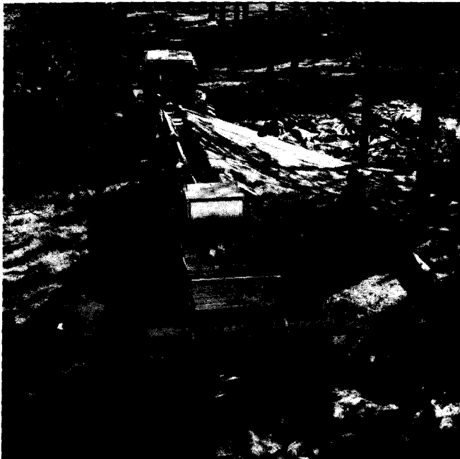
Figure 1—The MTDC's net retrieval-seed separator system positioned at the end of a netting row.

With MTDC's system, the net retrieval/seed separator units are positioned at the end of a netting row (figure 1). The edges of the netting are released from the adjacent nets and lifted to free the material from any grass growing up through the fabric. The netting is attached to the aluminum core on the retrieval unit and is reeled in under power (figure 2). The speed of retrieval can be varied based on the amount of material on the net.