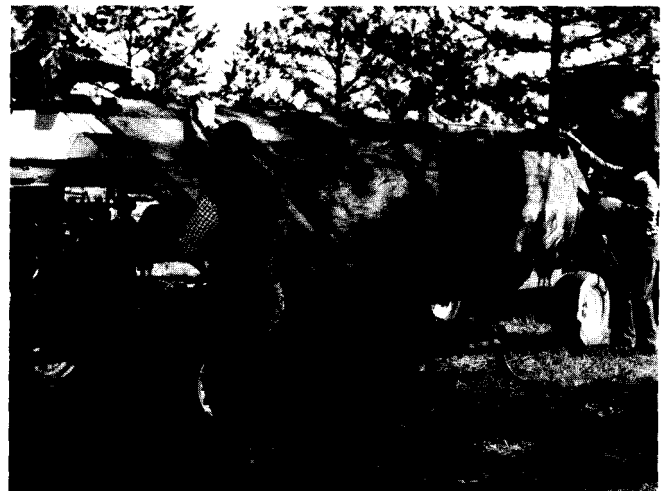
Figure 4 - Workers putting away the net retrieval-seed separator system. They find it easy to use and safe.

The cost of the net seed collection system will be greatly affected by the volume of seed available. Because of high initial equipment costs, a small or young low-yield orchard will not find the net retrieval system an economical alternative to cone collection. In a large-volume, mature seed orchard, however, the net retrieval tree seed collection system can produce seed at a reduced cost while enhancing worker safety and eliminating the need for expensive power platforms or bucket trucks (figure 4). Seven systems are currently in use: two in private orchards; four in southeastern U.S. Federal and State orchards, and one in a European orchard.