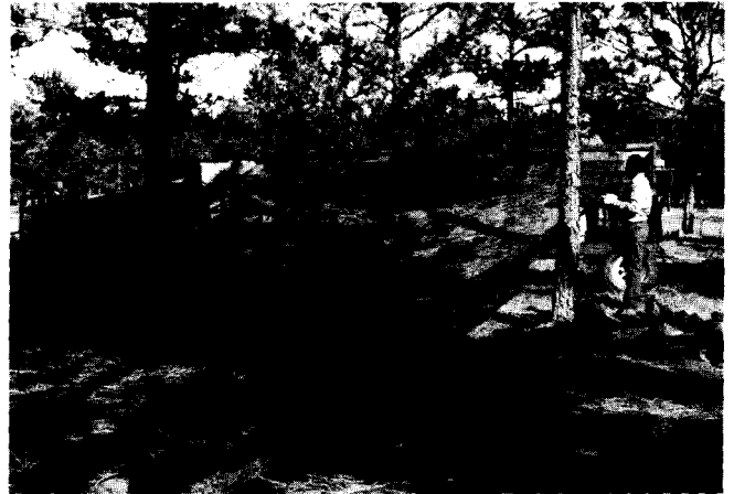
Figure 2—Reeling in the netting under power.

The system was extensively tested at three sites: the Francis Marion Orchard in South Carolina; the Erambert Orchard in Mississippi; and the Stuart Orchard