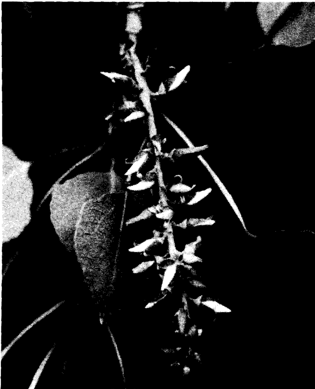
Figure 1 - Aspen capsules ready for picking.

Assemble a set of 30-cm diameter sieves (as shown in figure 2), starting with a pan at the bottom followed in ascending order by 60-, 40-, 20- and 10-mesh sieves. Lift up the top sieve and fill the 20-mesh sieve with cotton containing seeds. Reposition the top (10-mesh) sieve.