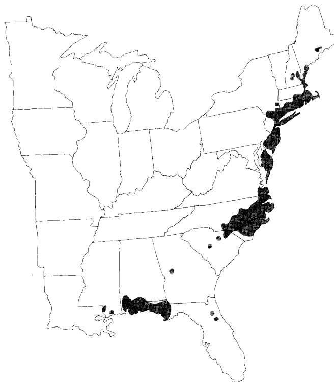
Figure 1 —Range of Atlantic white-cedar ( Chamaecyparis thyoides (L.) B.S.P.) (Little 1971).

We compared sexual and asexual propagation techniques that could assist regeneration and reforestation efforts in places where Atlantic white-cedar has failed to regenerate or cedar swamp establishment is desired for wetland mitigation. Seed propagation is relatively inexpensive, requires little technology, and