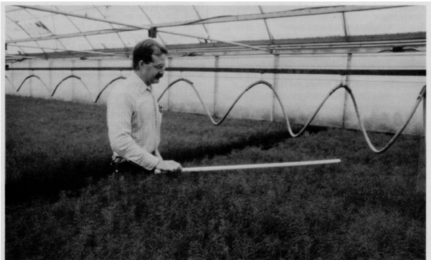
Figure 2—Brushing seedling foliage after an irrigation to dislodge water droplets and encourage drying.

that result in areas receiving excessive irrigation (Landis and others 1989b). Reducing irrigation frequency, irrigating early in the morning, and adding a surfactant to water reduces the time seedling foliage is wet, thus reducing conditions favorable to Botrytis infection (Sutherland and others 1989, Landis and others 1989a, Srago and McCain 1989, Dumroese and others 1990). Seedling foliage can also be brushed with plastic pipe or a wooden dowel to dislodge water droplets and encourage drying (figure 2). Besides reducing water necessary for spore germination and infection, reducing irrigation frequency would also help limit spore dispersal within greenhouses. Hausbeck and Pennypacker (1991) found that any cultural activity, especially irrigation of plant foliage, resulted in significant Botrytis spore dispersal. Other useful cultural controls include underbench ventilation and heating (Peterson and Sutherland 1990), growing seedlings at lower densities, spreading containers of susceptible species apart during periods of high seedling vulnerability (Landis and others 1989a), manipulating fertilizer regimes to maintain proper seedling size (Dumroese and others 1990), avoiding excessive nitrogen fertilization (Kingsbury 1989), and