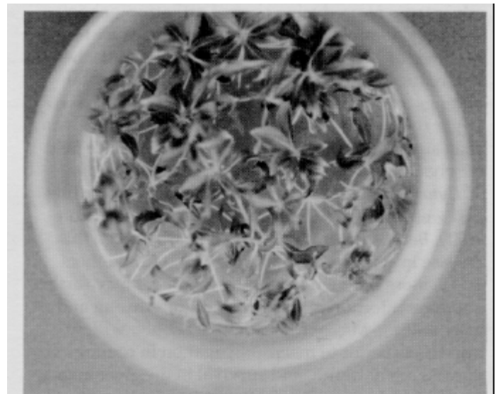
Figure 3 —Vigorous Scouler willow plantlets, rooted in vitro on an auxin-free nutrient medium lacking NAA, now ready for transplanting ex vitro to acclimatization under fog.

Ex vitro rooting. After 3 weeks, all rooting had taken place. Control microshoots rooted at 92.3% as compared to microshoots treated with Rootone® (57.7%). Thirty-eight percent of the microshoots treated with