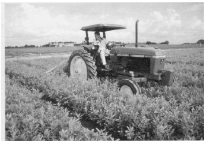
Figure 1— Top-pruning hardwoods (photograph courtesy of Sam Campbell, nursery manager, Kimberly-Clark Corp., Elberta, AL).

In this paper, research studies published over the last 60 years are reviewed to enable managers to make informed decisions about top-pruning (figure 2). A sickle-bar mower is the favored type of mechanical pruner because it makes a relatively clean cut. The following statements from nursery managers describe the details of its use. Stauder (1995) tells us that: