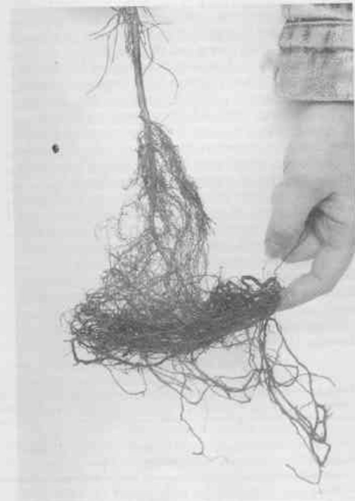
Figure 3 — Ponderosa pine roots were uniformly distributed, fibrous, and lacked any spiraling when grown in contact with Spin Out (left). Control roots were poorly distributed and generally concentrated at the bottom of the polybag (right).