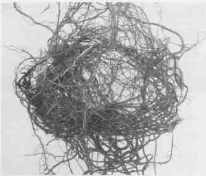
Figure 4 — Ponderosa pine roots spiraling in the bottom of a control polybag.

height when grown in copper-coated polybags (R. Phillips, see Crawford (1997)). Our observations that copper compounds applied to interior walls of containers promoted a more fibrous root system and more uniform root distribution and that an absence of copper promoted an accumulation of roots at container bottoms have also been reported by others (Arnold and Struve 1989; Schuch and Pittenger 1996).