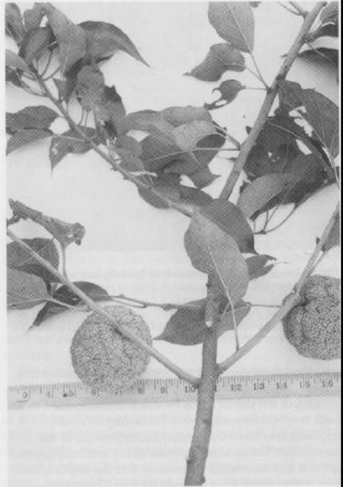
Figure 4—Ripe fruit (scale in inches).

Living fences. As a living fence, Osage-orange was a notable success when well established and properly cared for. Although failures were more frequent than successes, it was still the best option available at the time. Well-informed proponents of hedging had from the beginning emphasized the care needed: site preparation, viable planting stock, proper planting, an artificial fence to protect the young Osage-orange hedge during the first 3 to 4 years, protection from prairie fires, cultivation for 3 years, and trimming every year. Cutting back to 5- to 6-foot (1.5- to 1.8-m) height forced additional branch development at the base of the plant. The long-tough, thorny branches were then interwoven to make an impenetrable wall, and all invading woody plants, principally hackberry ( Celtis spp.), were removed. The width of the hedge usually was maintained at about 4 feet at the base and 2 to 3 feet at the top. Thus trimmed, a hedge excluded livestock but did not obstruct the view of the landscape.