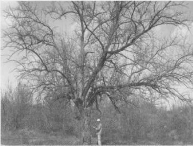
Figure 2 — Mature Osage-orange trees typically have short, curved boles and low, widespread crowns. Even in closed stands on good sites, less than half the stems contain a straight log that is 10 feet (3 m) long, sound, and free of shake. This open-grown tree stood in a pasture near Bastrop, LA, in March 1971.

struct rail fences and temporary dwellings. Immigrants arriving later found no available timber. Unregulated grazing of the public lands by herds of cattle and feral hogs was widespread (Lewis 1941). Any land not enclosed was treated as commons, regardless of the ownership. The fencing problem of the 19th century was general and traumatic; its severity and the depth of feelings it engendered are difficult for late 20th-century Americans to imagine.