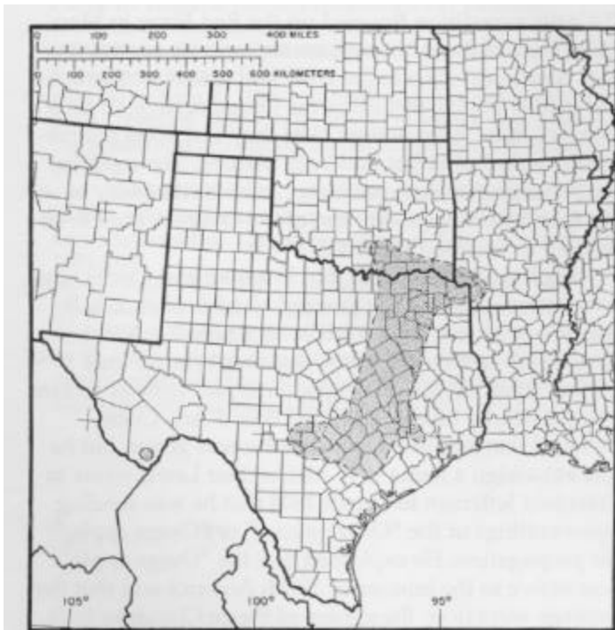
Figure 1— Map of the known natural range of Osage-orange in historical times. The range has been extended greatly by planting.

The prairie lands of the Midwest and the Great Plains were acutely deficient in wood, water, and field stone. Wood shortage was second only to water shortage in retarding settlement of the Great Plains by farmers (McCallum and McCallum 1965). Actual availability of wood was reduced further by the use of rail fences and the pattern of settlement. The first English-speaking settlers took possession of the isolated pockets and streamside strips of timber, using most of the wood to con-