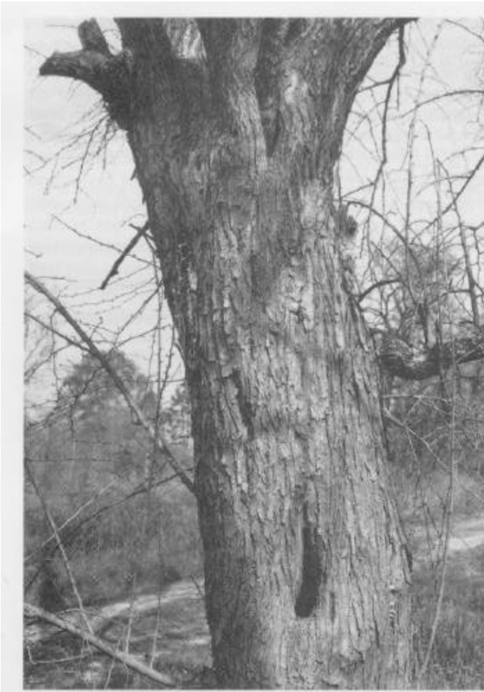
Figure 5 —Typical bole of an Osage-orange tree showing crookedness and defects common to the species.

orange seeds and seedlings ended. However, barbed wire still required posts, which the Osage-orange hedges provided.