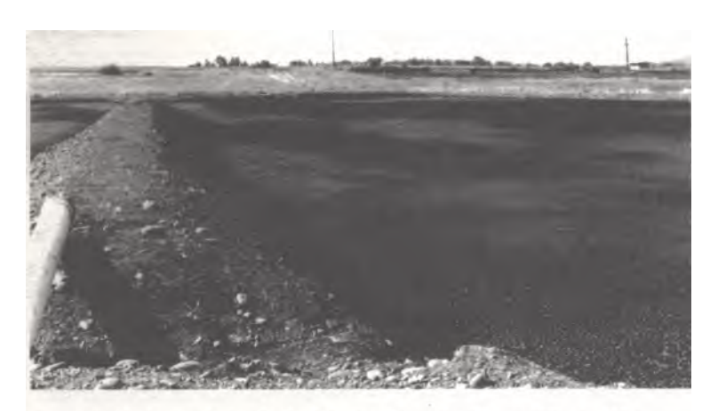
Figure 6. Sludge in drying beds following digestion. Vernon Thorpe Water Quality Control Plant, City of Medford.