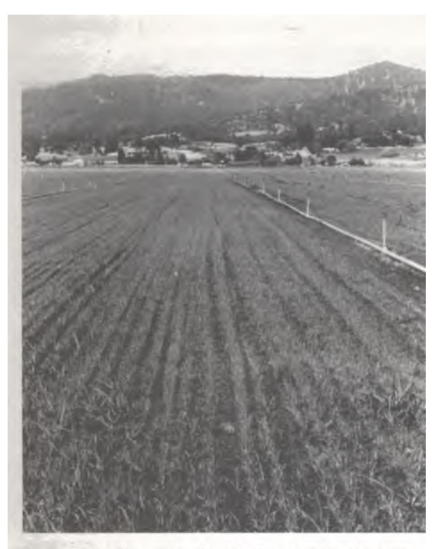
Figure 5. Sawdust watered just before planting the cover crop. J. Herbert Stone Nursery, Medford, Oregon.

As an Incorporated Amendment. Disking is preferred over plowing to incorporate wood products. Amounts of sawdust, bark, or wood chips to incorporate may vary according to desired organic level. Application rates range from 10-100 tons per acre. Optimal time to incorporate is before the cover crop is planted rather than before seedlings are planted (Figure 5).