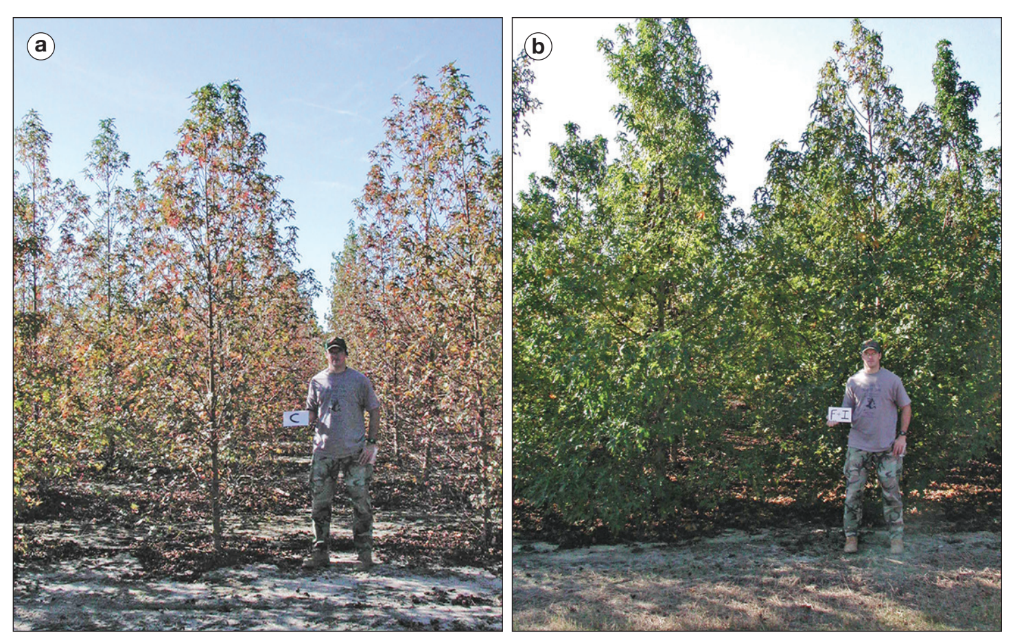
Figure 4. Photos of sweetgum ( Liquidambar styraciflua L.) plots (a) without amendments and (b) with fertilization + irrigation amendments.

Interactions between amendment and season were associated with increased canker lengths that developed in the summer of 2004. During the final inoculum test period, the sweetgum trees were approaching 4 years in age and ranged from 5.2 to 6.7 m (17.0 to 22.0 ft) in height (Coyle et al. 2008). Young sweetgum trees have a conical growth shape and lower branches on the trees were beginning to touch adjacent trees in the planting. This additional shading may be the cause of the increase in canker lengths found during the summer 2004 season, especially in the internal cankers, compared with the previous seasons (figure 3). The fertilization + irrigation treatment had visibly more crown closure (figure 4), with the greater diameter, height, and aboveground biomass after the 2003 growth season (Coyle et al. 2008). This result, coupled with no clear differences in canker development during 2002 to 2003 in the fertilization + irrigation treatment, indicates that