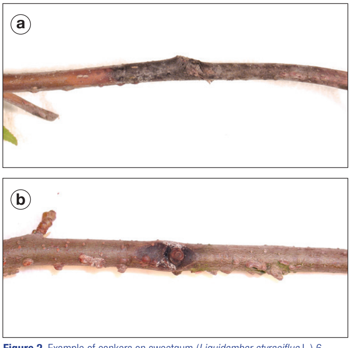
Figure 2. Example of cankers on sweetgum ( Liquidambar styraciflua L.) 6 months after inoculation with (a) Botryosphaeria dothidea and (b) Lasiodiplodia theobromae. (Photo by Michelle Cram, April 2003).